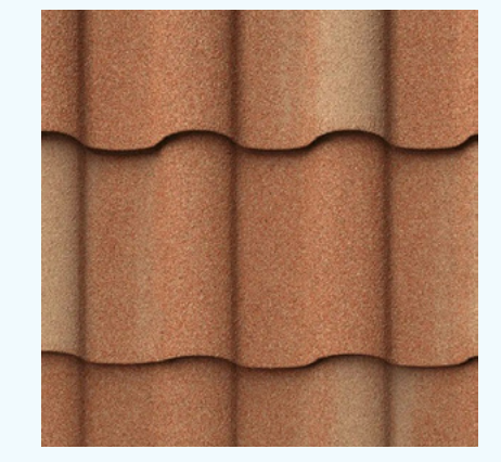
DECRA Villa Tile