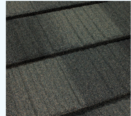
Tilcor Craftsman Shake

For Overlapping Panels with EBS batten system PN: 17550, 17554,