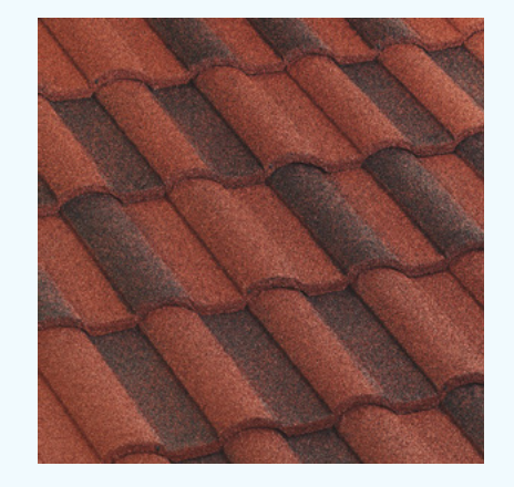
Unified Steel Barrel-Vault Tile