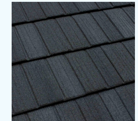
Tilcor CF Shake

For Overlapping Panels, Direct-to-Deck Install PN: 17628, 17550,