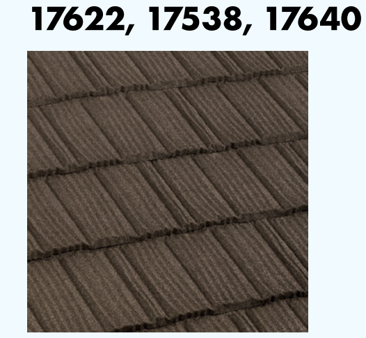
Unified Steel Pine-Crest Shake

For Overlapping Panels with EBS batten system PN: 17550, 17554,