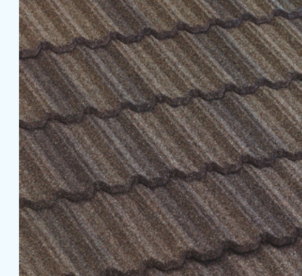
Unified Steel Pacific Tile