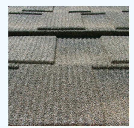
DECRA Shingle Plus

For Overlapping Panels Direct To Deck - PN: 17628 On-Batten - PN: 17550 , 17554, 17622, 17538