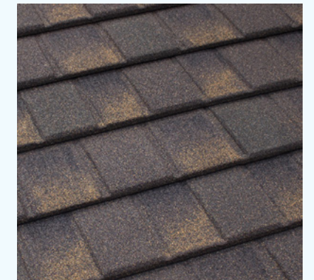
Tilcor CF Shingle