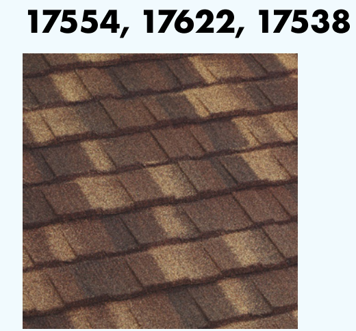
Unified Steel Cottage Shingle

For Overlapping Panels, Direct-to-Deck Install PN: 17628, 17550,