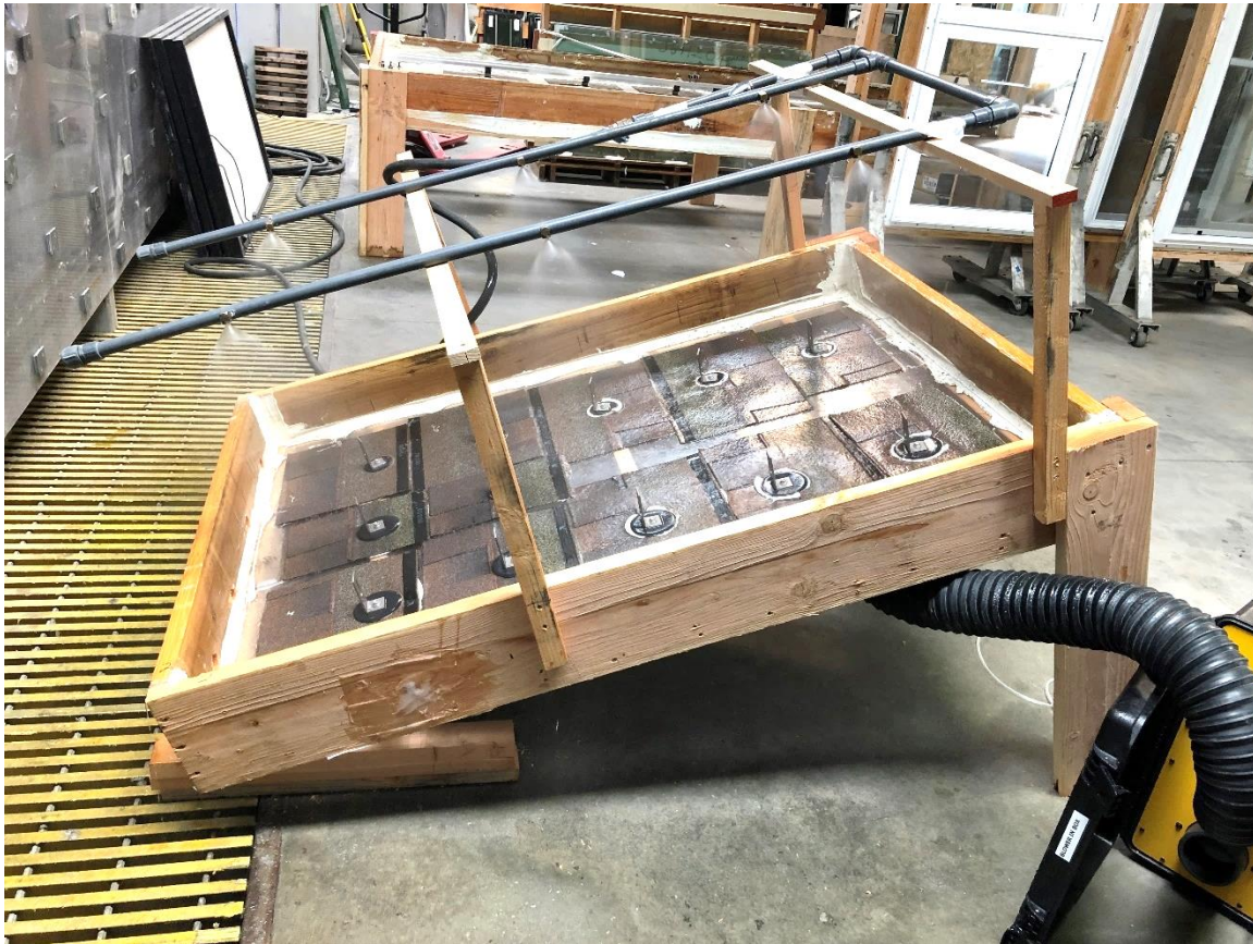
Photo No. 1 The specimen during ASTM E331 testing.